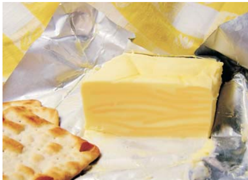
With other colorants

How to reduce costs while maintaining the quality of your margarine? Use the right ingredients! Carotene-Plus is by far the most effective product for coloring margarine. Check out some of its great advantages: